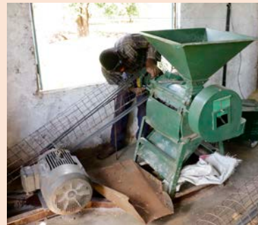
Maize Mill www.kilitech.org